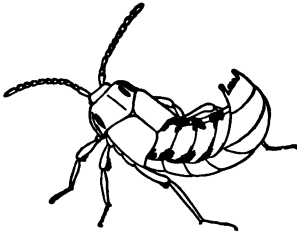
Fig. 4. Lomechusa strumosa F. (Magnified.)

shows the beetle Lomechusa strumosa so often referred to, and one of its larvae, magnified to four times their natural size.